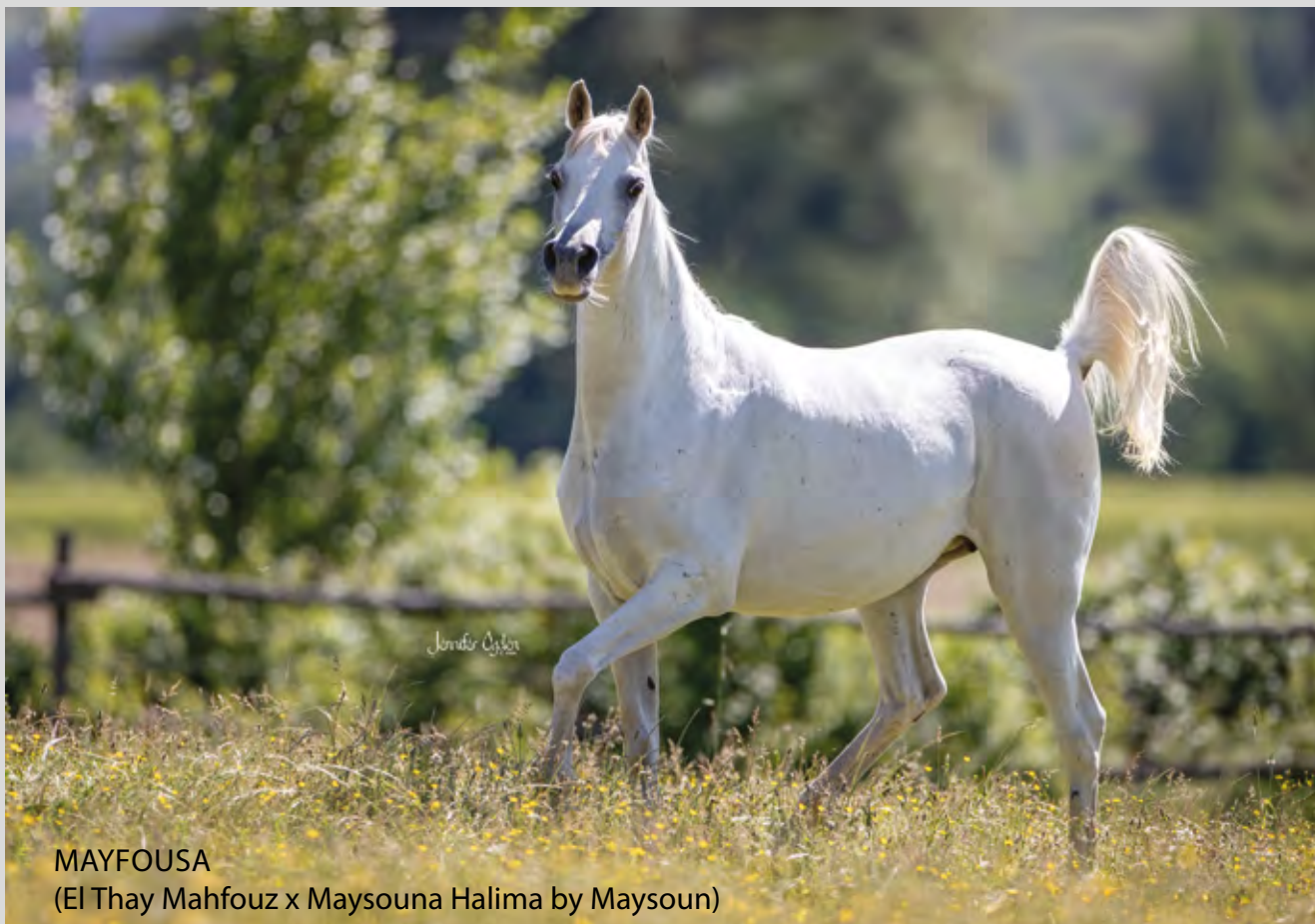
MAYFOUSA (El Thay Mahfouz x Maysouna Halima by Maysoun)