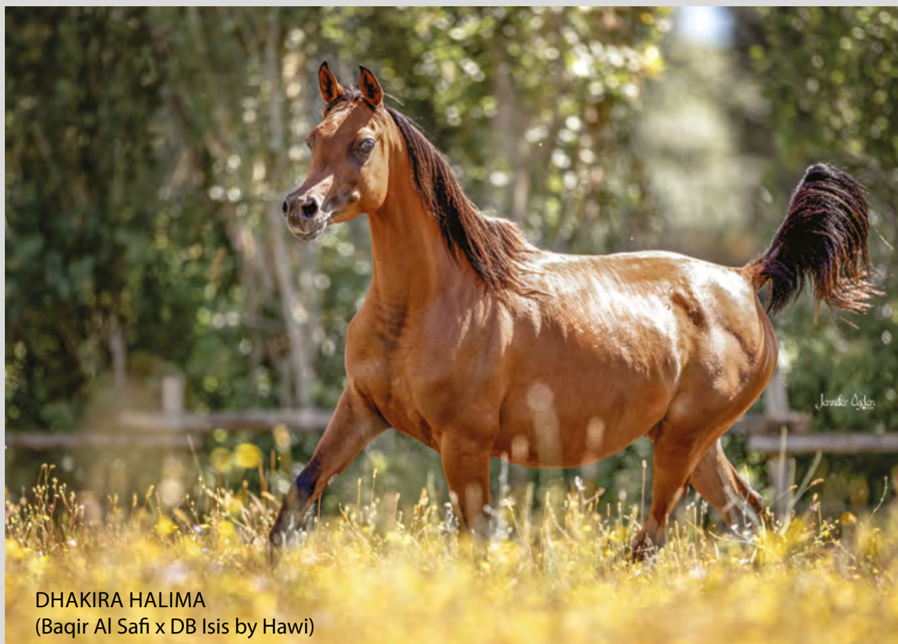
DHAKIRA HALIMA (Baqir Al Safi x DB Isis by Hawi)