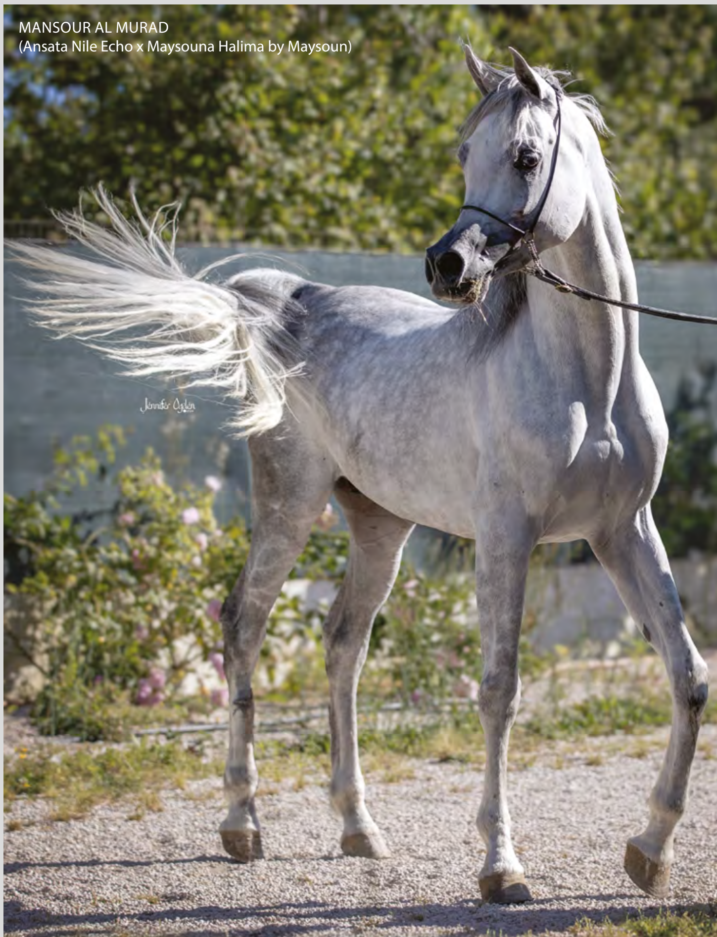
MANSOUR AL MURAD (Ansata Nile Echo x Maysouna Halima by Maysoun)