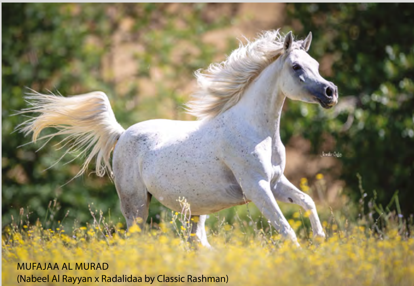
MUFAJAA AL MURAD (Nabeel Al Rayyan x Radalidaa by Classic Rashman)