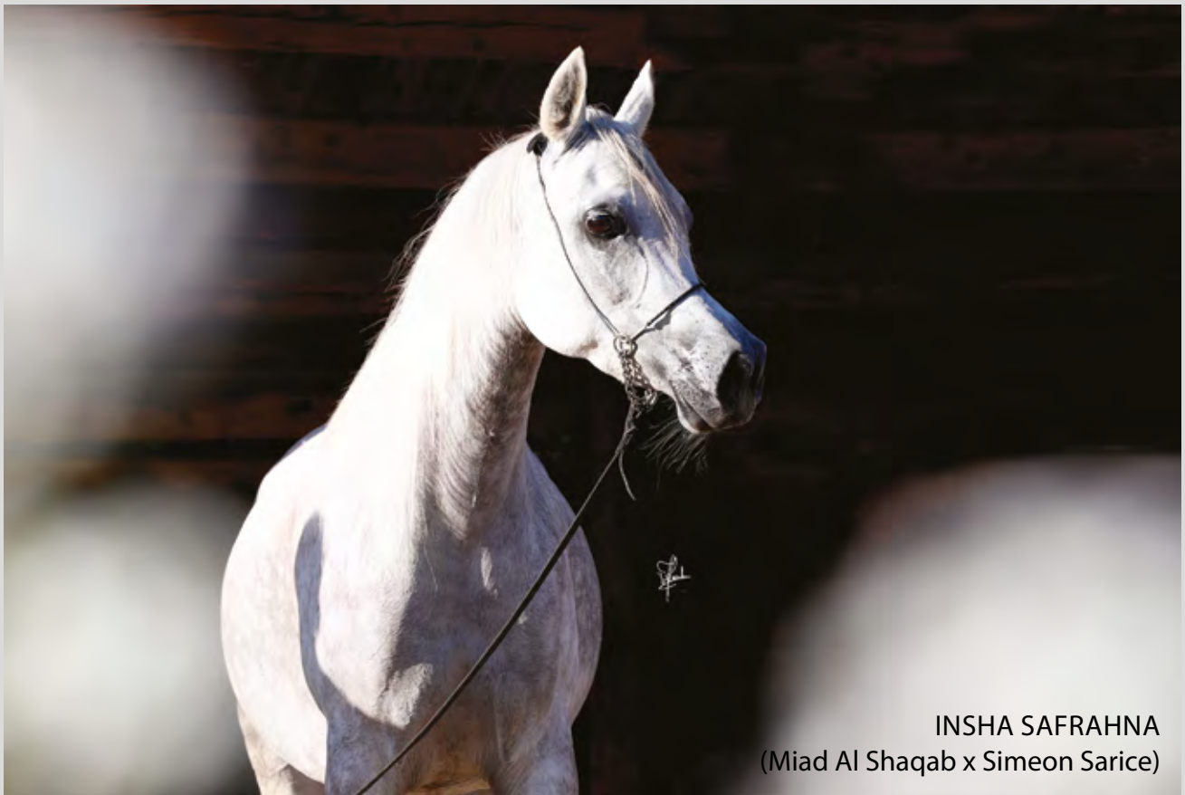
INSHA SAFRAHNA (Miad Al Shaqab x Simeon Sarice)